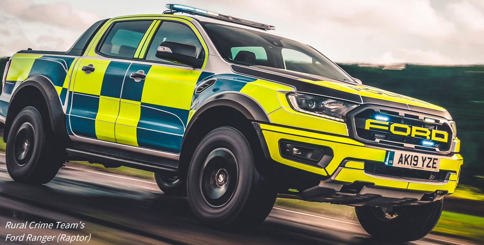
Rural Crime Team's Ford Ranger (Raptor)