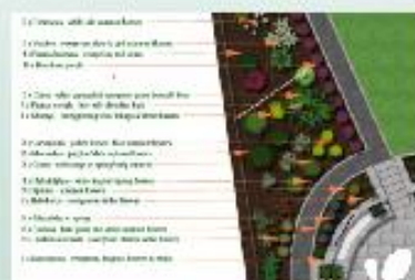
We offer planting design & supply for year-round colour

Get spring ready. Call Philip today to book your FREE garden consultation