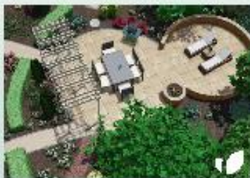
We layout space for outdoor living & convenience