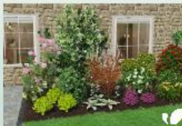
We save you time with maintenance plans & training