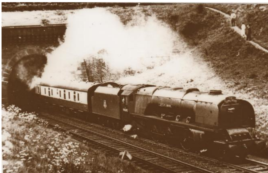
LMS express train emerging from the southern end of Kilsby Tunnel.